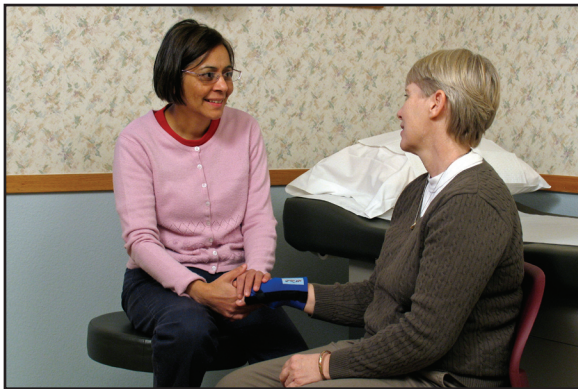
For treatment that goes beyond just medicine.

St. Joseph Regional Medical Center offers access to comprehensive cancer treatments provided by a multidisciplinary team of cancer specialists. In addition to professional collaboration, we have access to the latest innovative treatments and state-of-the-art equipment. We offer coordination with other centers for clinical trials. Patient comfort and well being are of primary focus and importance. For treatment that goes beyond just medicine, come to the only cancer treatment center within a 100 mile radius. We are proud to be the only Commission on Cancer/American College of Surgeons Accredited Community Cancer Center in the region.