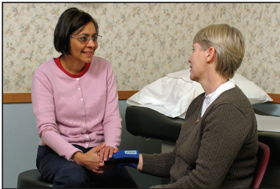
For treatment that goes beyond just medicine.

St. Joseph Regional Medical Center offers access to comprehensive cancer treatments provided by a multidisciplinary team of cancer specialists. In addition to professional collaboration, we have access to the latest innovative treatments and state-of-the-art equipment. We offer coordination with other centers for clinical trials. Patient comfort and well being are of primary focus and importance. For treatment that goes beyond just medicine, come to the only cancer treatment center within a 100 mile radius. We are proud to be the only Commission on Cancer/American College of Surgeons Accredited Community Cancer Center in the region.